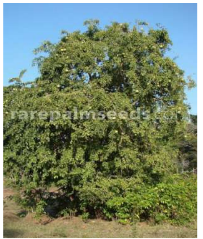
Fig 1 . Plant of Aegle marmelos