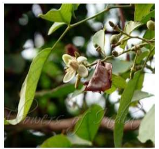
Fig flower of Aeglemarvelous

Fruit: After diarrhea, fruit is consumed to aid in the healing process. Work well as a dysentery treatment and for mild astringency. The South Chhattisgarh traditional healers employ dry Fruit powdermixed withmustard oil to cure burns instances. Two parts mustard oiland one partpowder are combined and used externally.