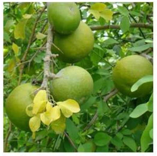
Fig . fruits of aegle marmelos

Additionally, fruits are utilized in digestive issues, constipation laxatives, tonic, and stomach problems gastric, cardiac, and brain tonic, ulcerative, antiviral, and intestinal gonorrhea, epilepsy, and parasites.[38,47]