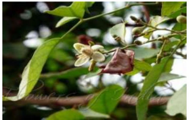
Fig. Aegle marmelos leaves