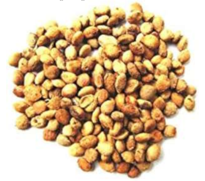
Fig : Aegle marmelos seeds