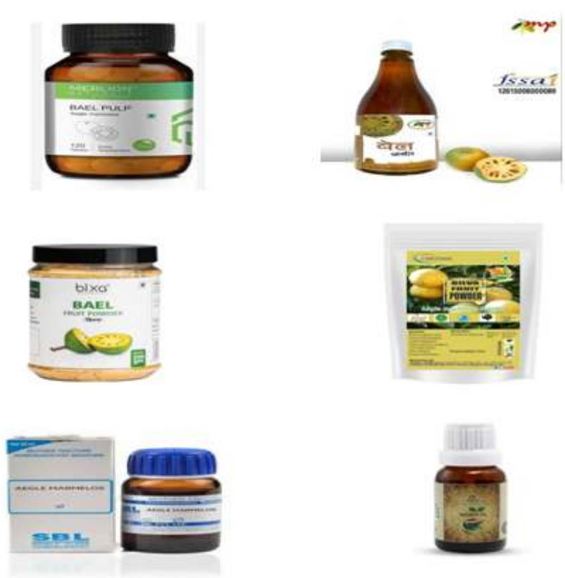
Some Of The Marketed Products Formulations Of Aegle Marmelos.