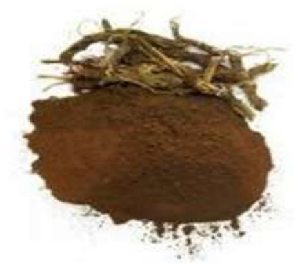
Fig roots of Aeglemarvelous

for appetite loss. and puerperal illnesses, such as. irritation of the uterus.[41]