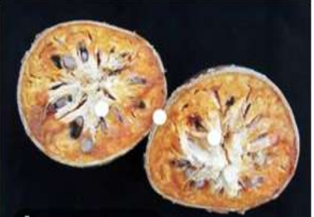
Fig. ripe fruit of aegle marmelos

Stomach discomfort. Fresh fruit juice has a strong, bitter flavor. the extract reduces bloodsugarlevels.[3847]