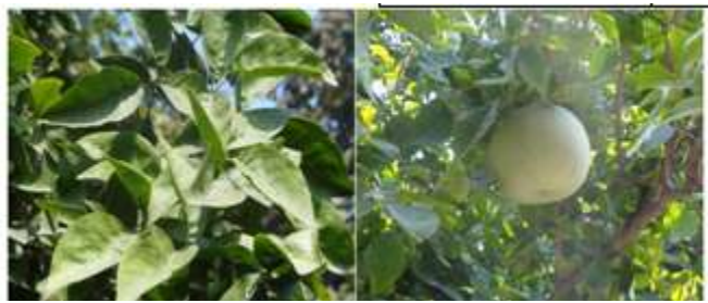
Fig .Leaves and fruits of Aegle marmelos